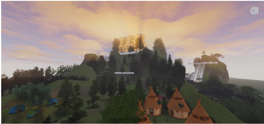
Fig 4. Overall Landscape of the Beras Tagi Roblox Metaverse

Figure 4 provides a comprehensive overview of the virtual environment constructed within the Roblox engine. This macro-level perspective highlights the structural coherence of the metaverse, demonstrating how the environment is optimized to create an immersive, contiguous world that facilitates seamless user traversal and interaction across the simulated region.