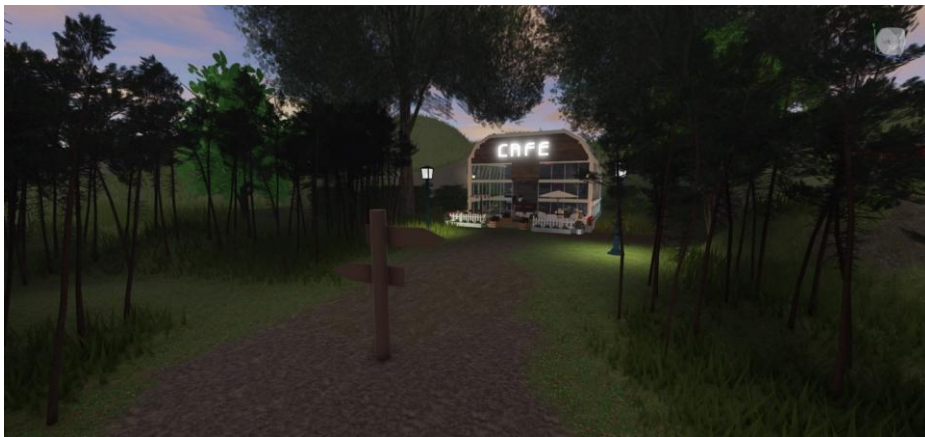
Fig. 3. Spawn Location of Beras Tagi Verse

The following presents the development results of several tourist destinations in Berastagi that have been visualized within the Roblox metaverse: