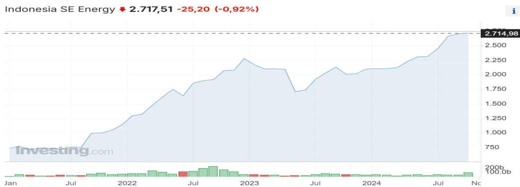
Image 2. IDXENERGY Graph Data

The phenomenon of corporate financial performance as seen from the movement of company profits and the development of the energy sector that is filled with dynamics makes this study interesting. The differences in the previous research also make this research worth testing. Therefore, of all the aspects that have been shown, this study aims to see how the influence of financial and macroeconomic performance on stock prices with CSR as moderation in energy sector companies contained in the ISSI index in 2020-2023.